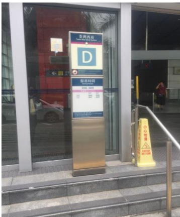
Tsuen Wan West Station Exit D 荃灣西鐵站 D 出口