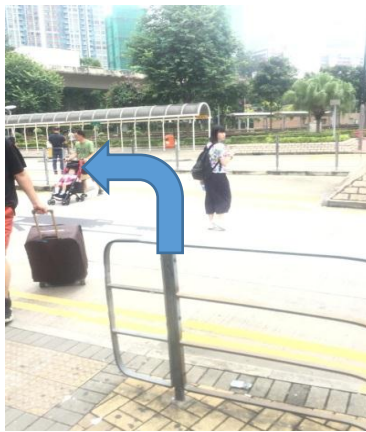
Across the road and turn left 橫過馬路後轉左直行