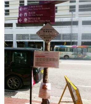
Reach the bus stop for waiting hotel shuttle bus 到達酒店穿梭巴士候車站