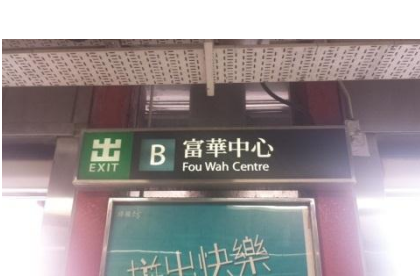
Turn left from Tsuen Wan MTR Station Exit B 荃灣港地鐵站 B 出口轉左