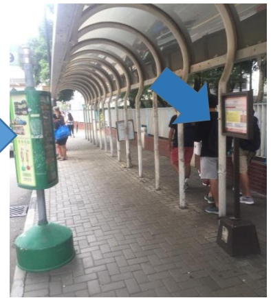
Reach the bus stop for waiting hotel shuttle bus 到達酒店穿梭巴士候車站