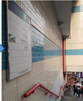
Walk down the stairs 從樓梯往下走